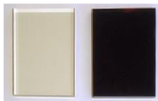
Non-Browning Optical Glass