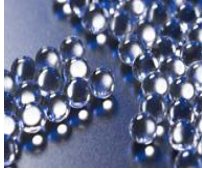
Low Tg Optical Glass